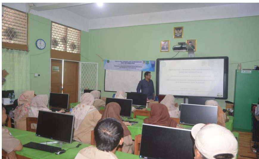
Figure 2. Implementation of Database Creation Training for Storing and Managing School Data