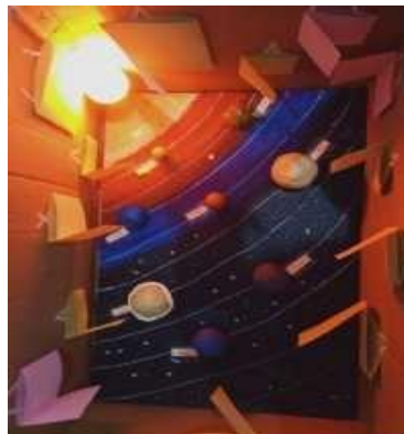
Image 1. Magical Ancient Box Media

The application of the media learning the Magic Ancient Box with the child is welcome to see and observe the pre-fill of the box, so that it draws their