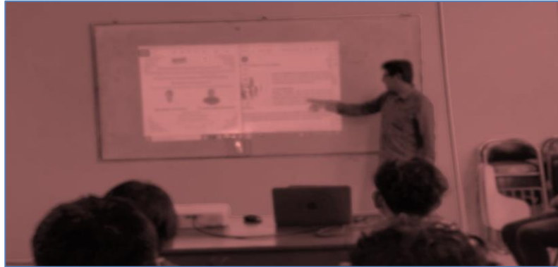
Figure 2. Implementation of Training

This diagram shows the logical flow of service activities from preparation to dissemination of results, illustrating a systematic framework for training implementation and evaluation.