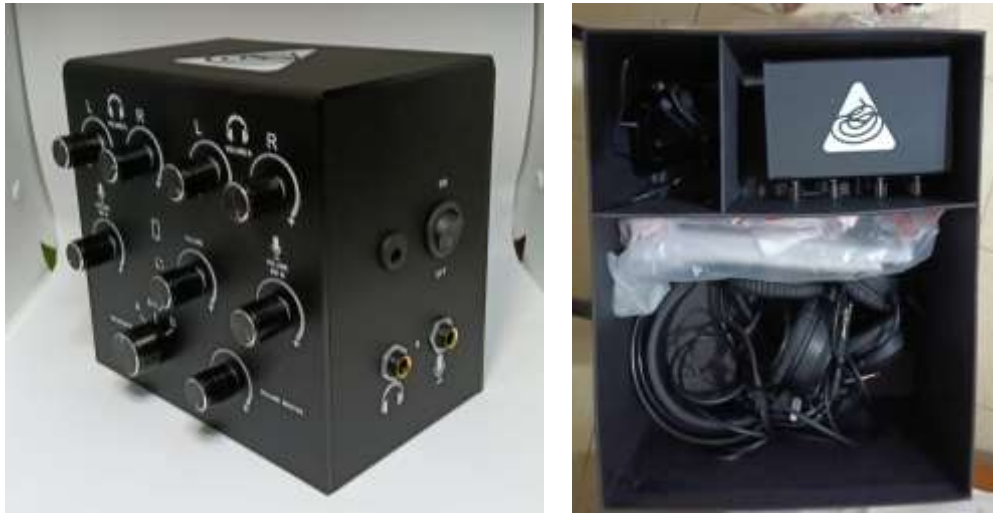
Figure 1. VCBox

VCBox's ability to isolate and enhance the clarity of auditory input is critical in learning the hijaiyah alphabet, which requires high-level phonetic discrimination. In traditional classroom settings, students often have difficulty distinguishing the sound characteristics of similar letters such as \text{ت} (tsa) and \text{س} (sin), or \text{ح} (ha) and \text{ه} (ha). VCBox addresses this problem by creating an optimal audio environment, allowing students to hear subtle details in pronunciation that might be missed under conventional learning conditions.