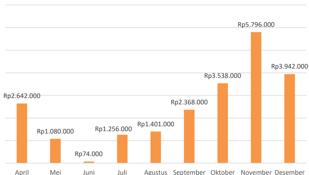
Table 1.3 Plantation unit revenue in 2021

The chart above, is a comparison of the remaining business results in bumdes Amanah in the last five years. It can be seen the development of the operating profit of BUMDes Amanah which has increased every year. Only in 2016 experienced a decrease of IDR 17,325,574.